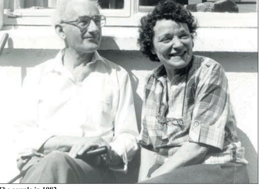
The couple in 1982.

Models shown for illustration purposes only. All prices and offers correct at time of going to print. The Donnelly Motor Group reserves the right to withdraw these offers at any time, without notice. Errors and ommissions excluded.